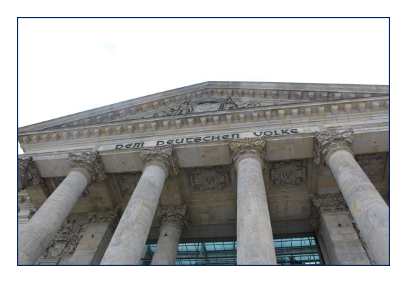
PHOTO: The German Reichstag, by Maegan Burns, a current Duke in Berlin exchange student